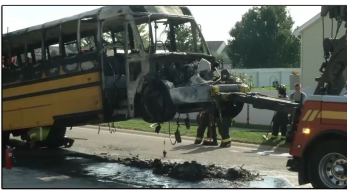
The EV school bus greatly diminishes this risk to our children.