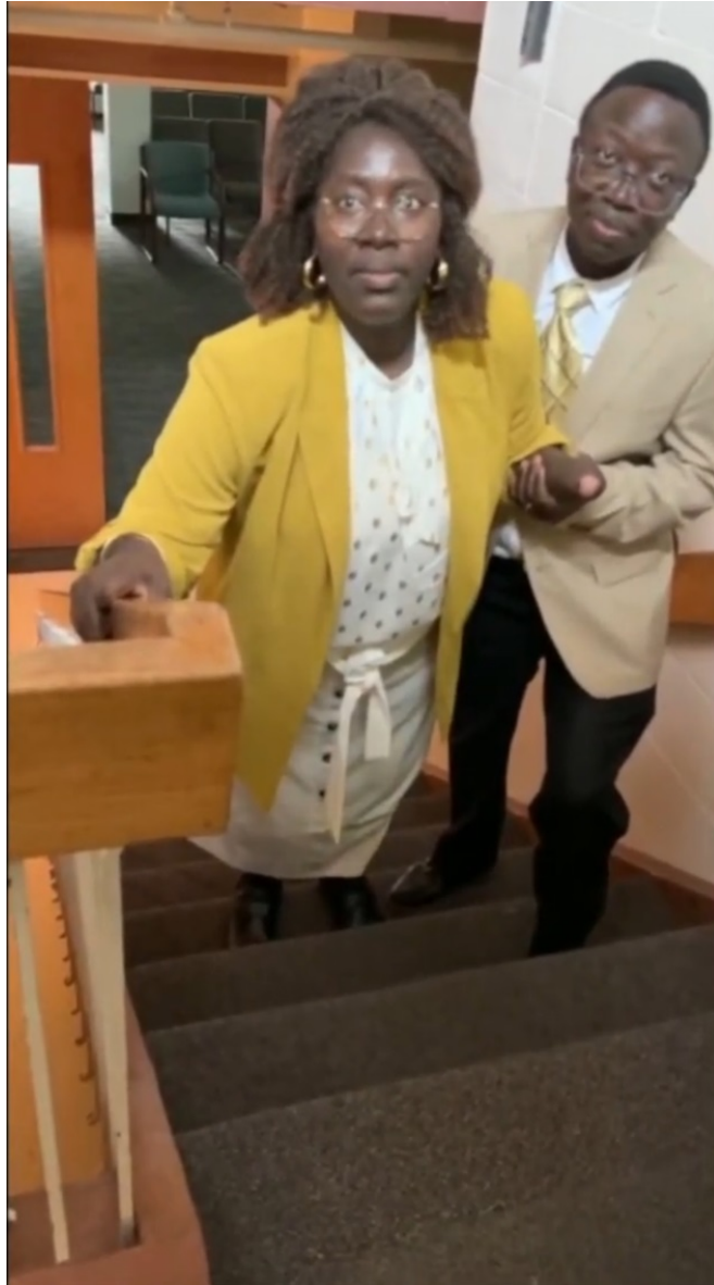
Medical Status After Hospital Mandated Pfizer modRNA "vaccine" Injections