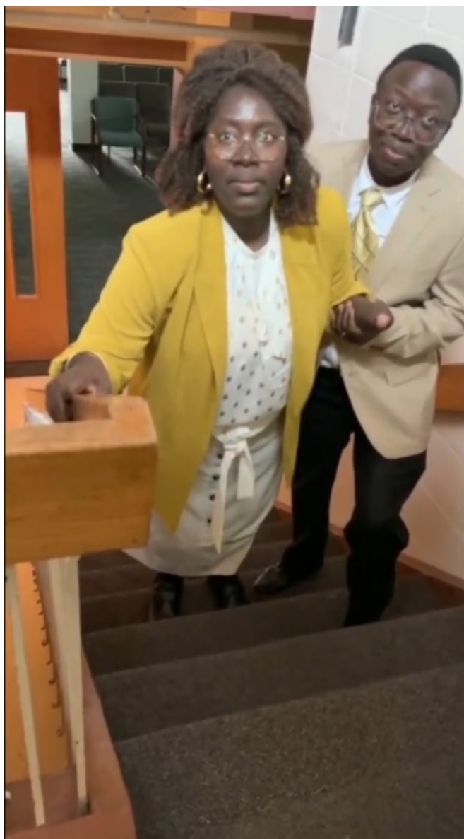
Medical Status After Hospital Mandated Pfizer modRNA "vaccine" Injections